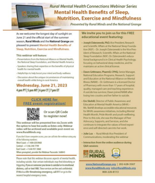
Click the image to enlarge