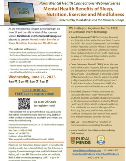
Click the image to enlarge