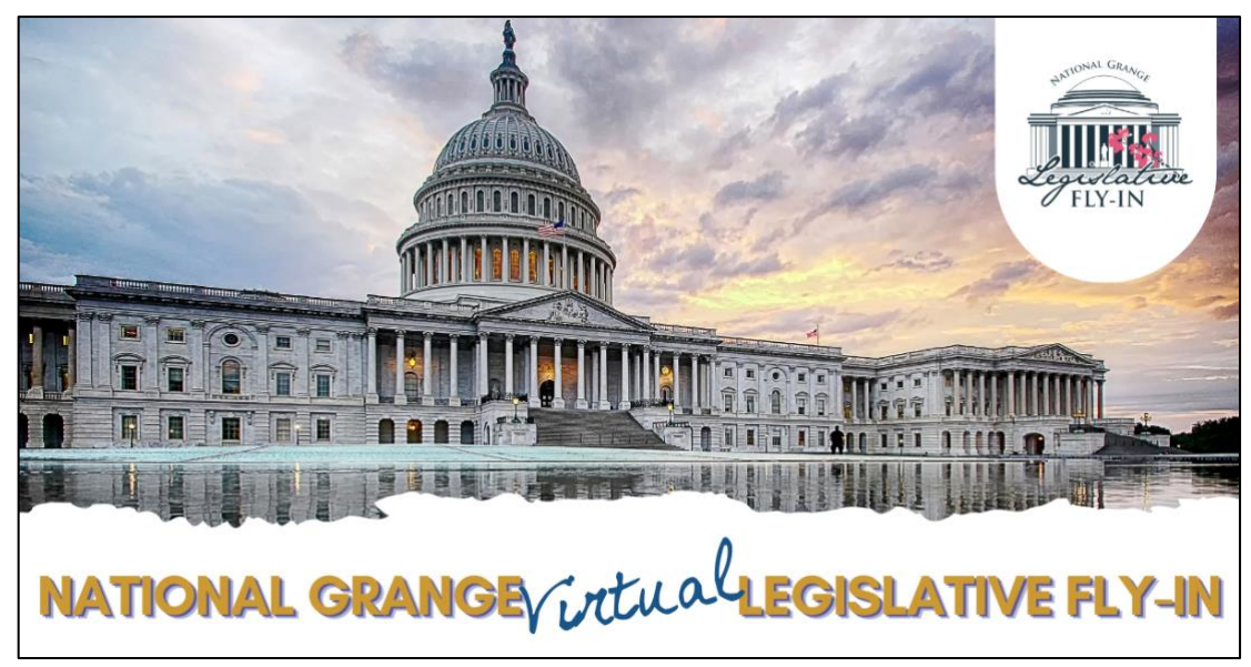
Click the banner to register for the Fly-In!